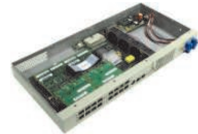
© 2011 Interphase Corporation. All rights reserved.

Interphase experience will be here to support you throughout the life of your product, managing component obsolescence, improving manufacturability, testing, and reliability while continuously providing customer support.